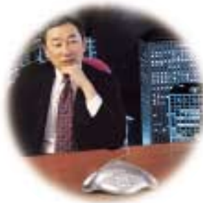
Conduct remote meetings...

If you work in a small to medium-sized business, chances are that you are still using low-quality, handset speakerphones to conduct important business with co-workers, and even customers. Handset speakerphones are fine for listening to voicemail or conducting short conversations, but usually fail to maintain natural two-way communication necessary to maximize productivity and conduct effective business meetings.